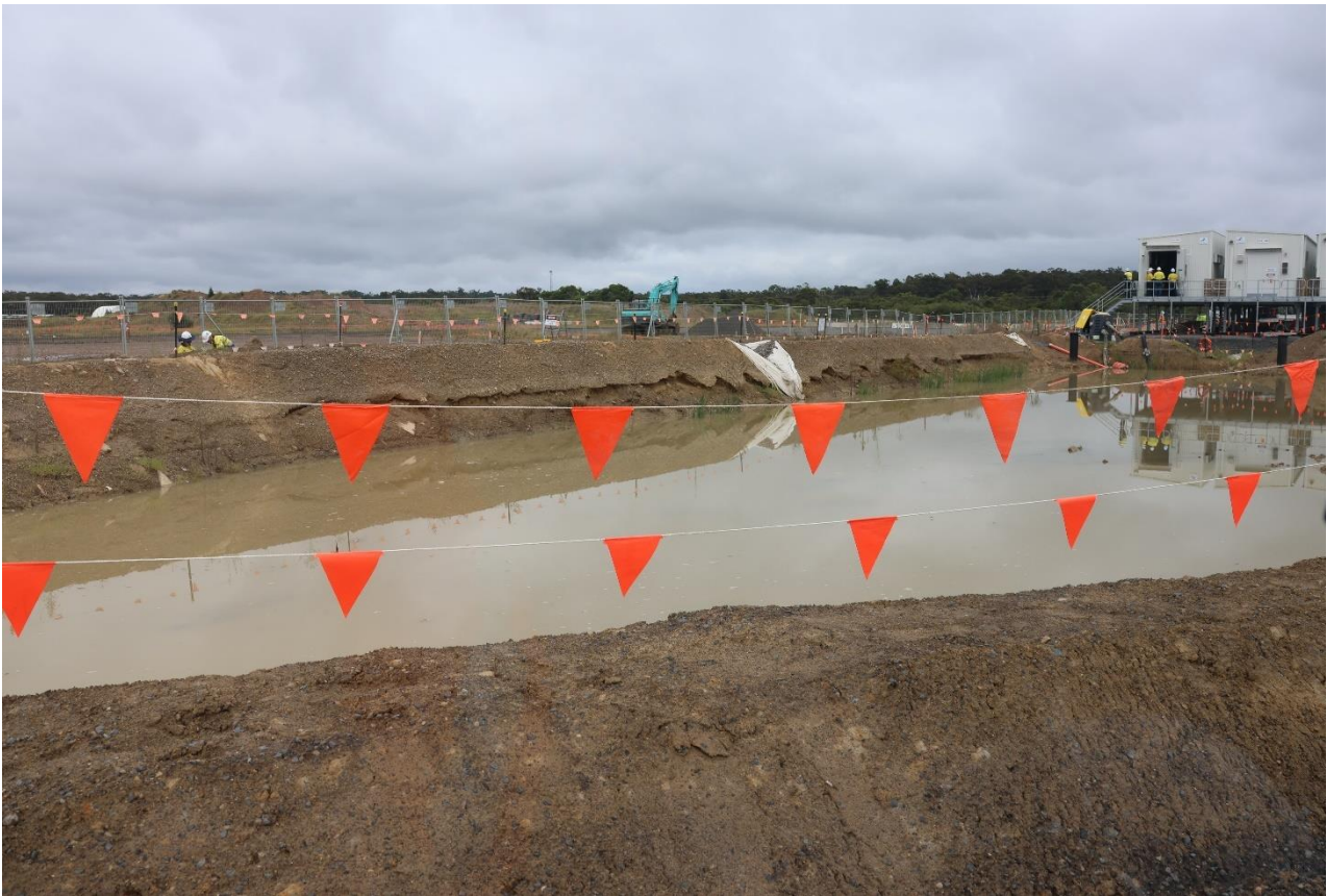
Photograph 4 - Area 2 Retention Basin