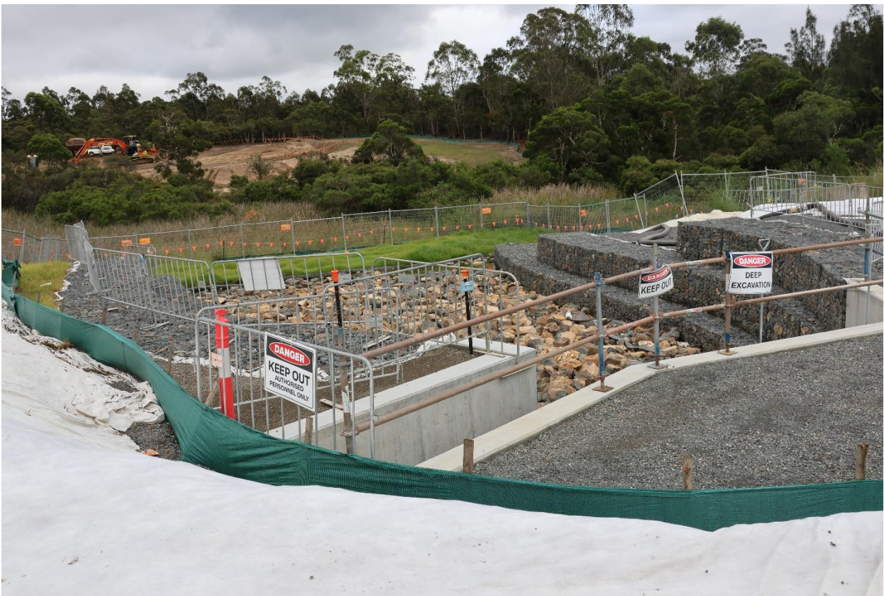
Photograph 6 - Site Water Discharge Infrastructure