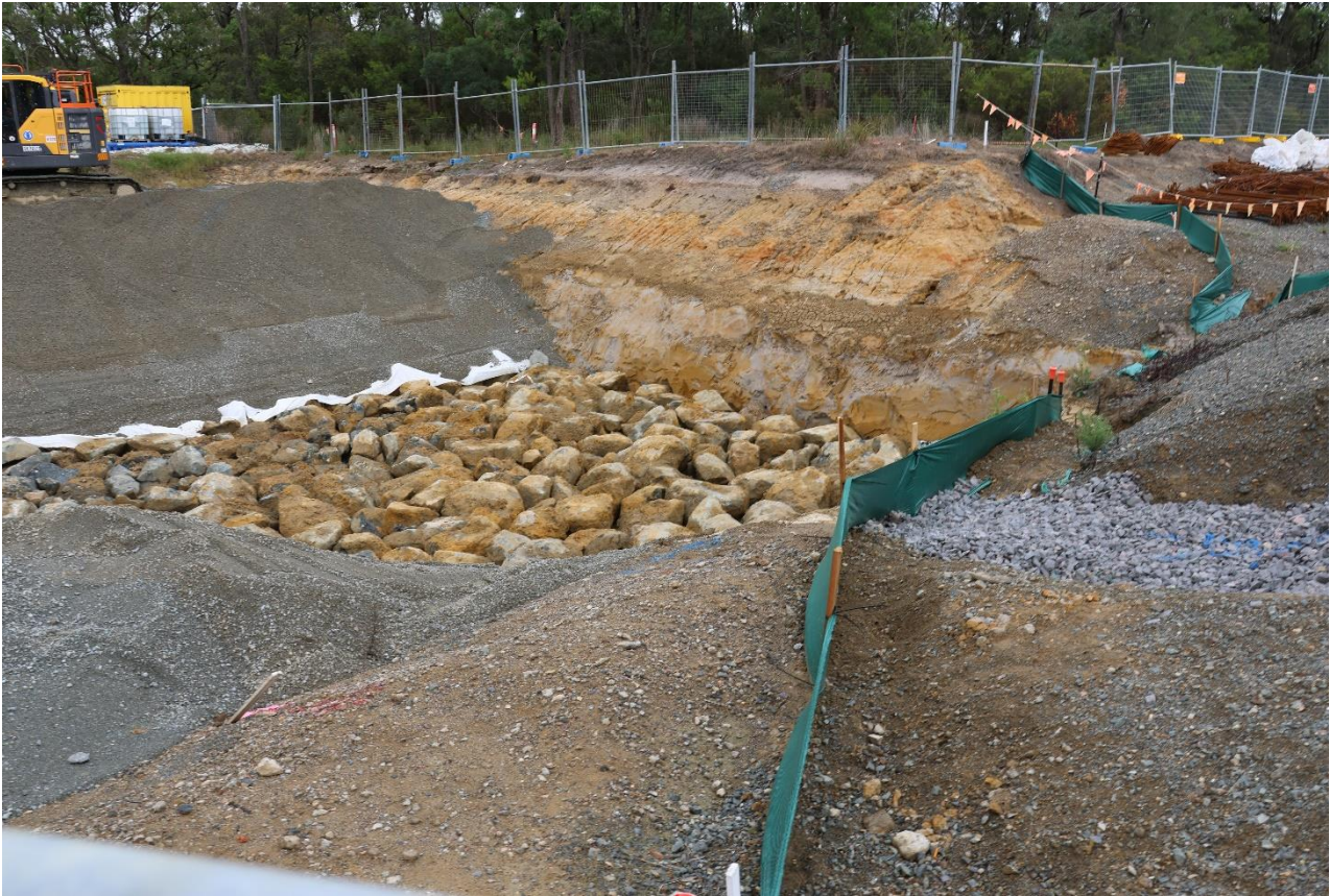
Photograph 5 - Area 1 Retention Basin