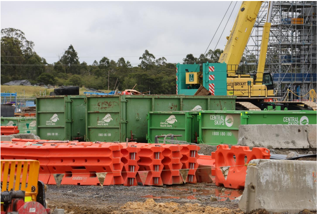
Photograph 7 - Construction Waste Storage