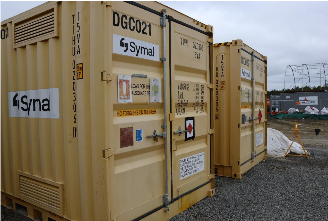
Photograph 1 - Hazardous Chemicals Storage Containers