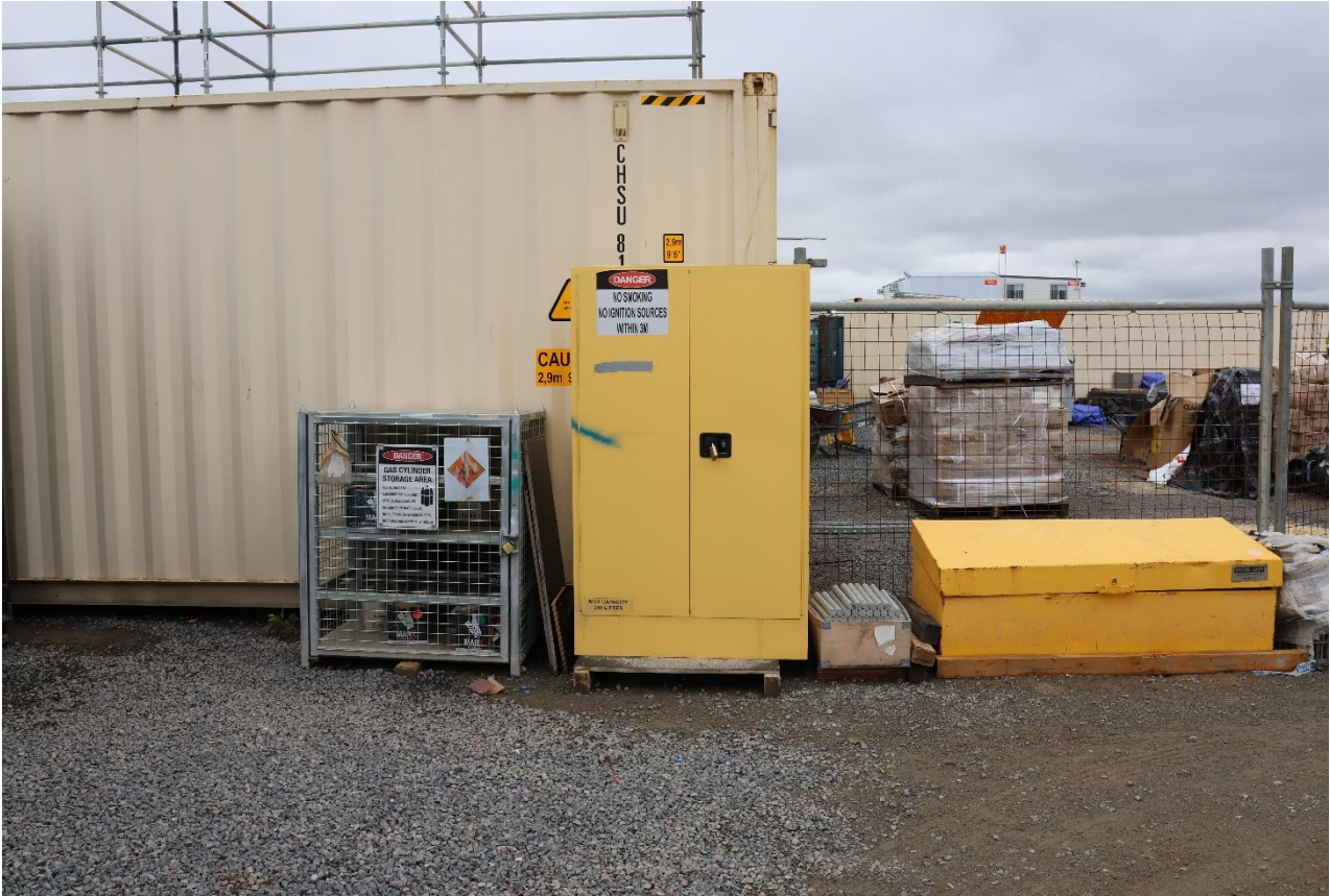
Photograph 2 - Hazardous Chemicals Storage