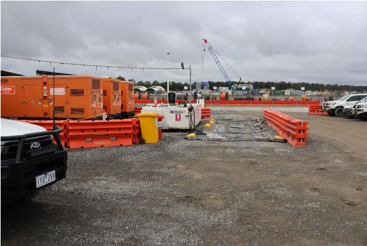
Photograph 3 - Fuel storage and refueling area