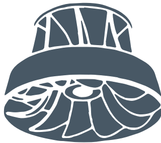
FRANCIS REACTION TURBINE